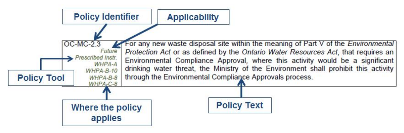
Figure 1: Example of a Source Protection Plan Policy